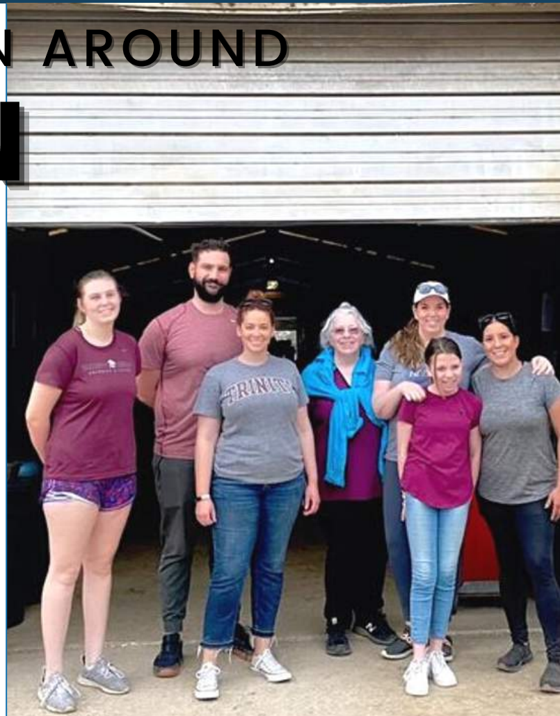
Alumni from Trinity University