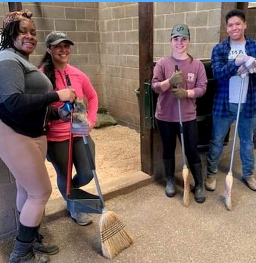
Navy Medical Group